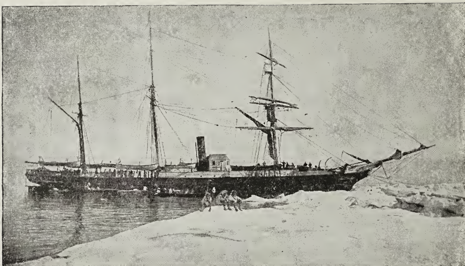
U. S. Revenue Cutter " Bear " Communicating with Siberian Deermen.